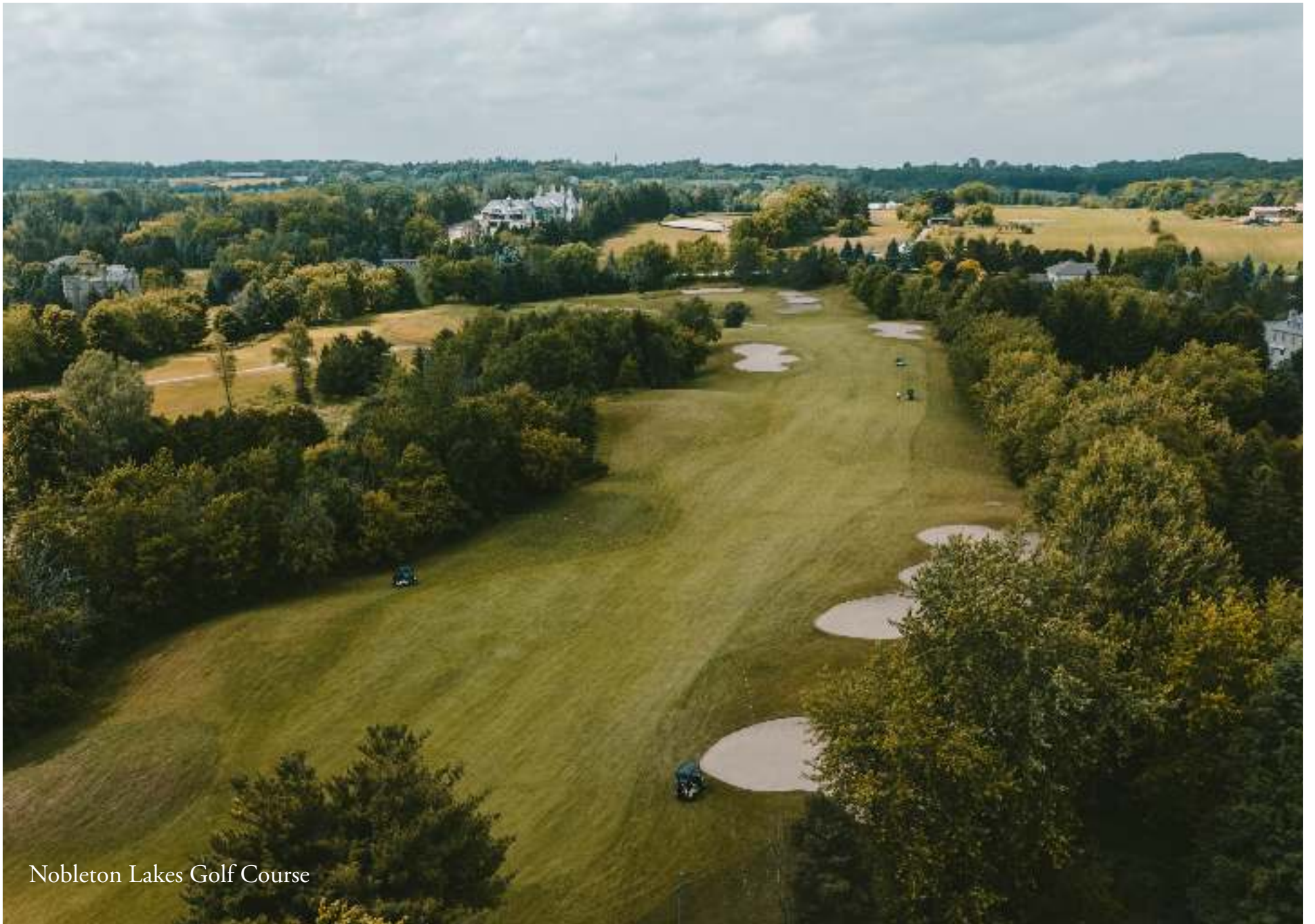
Nobleton Lakes Golf Course