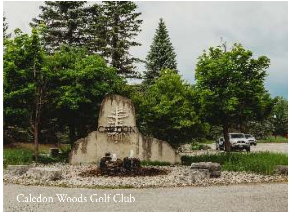
Caledon Woods Golf Club

Fresh air on the scenic fairways of the nearby Mayfield Golf Club and the Glen Eagle Golf Club , is a beautiful way to enjoy the outdoors. Whether it's an early morning tee time, a weekend round with friends or simply the pleasure of living near open green spaces, Caledon's finest golf courses are close to home.