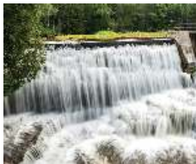
Belfountain Conservation Area