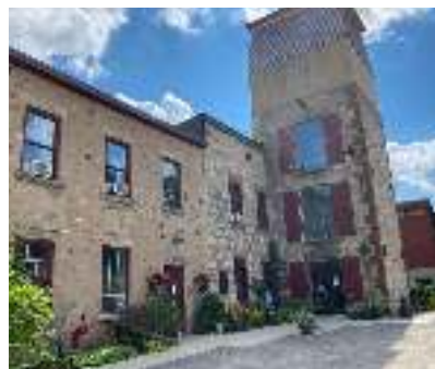
Alton Mills Art Centre