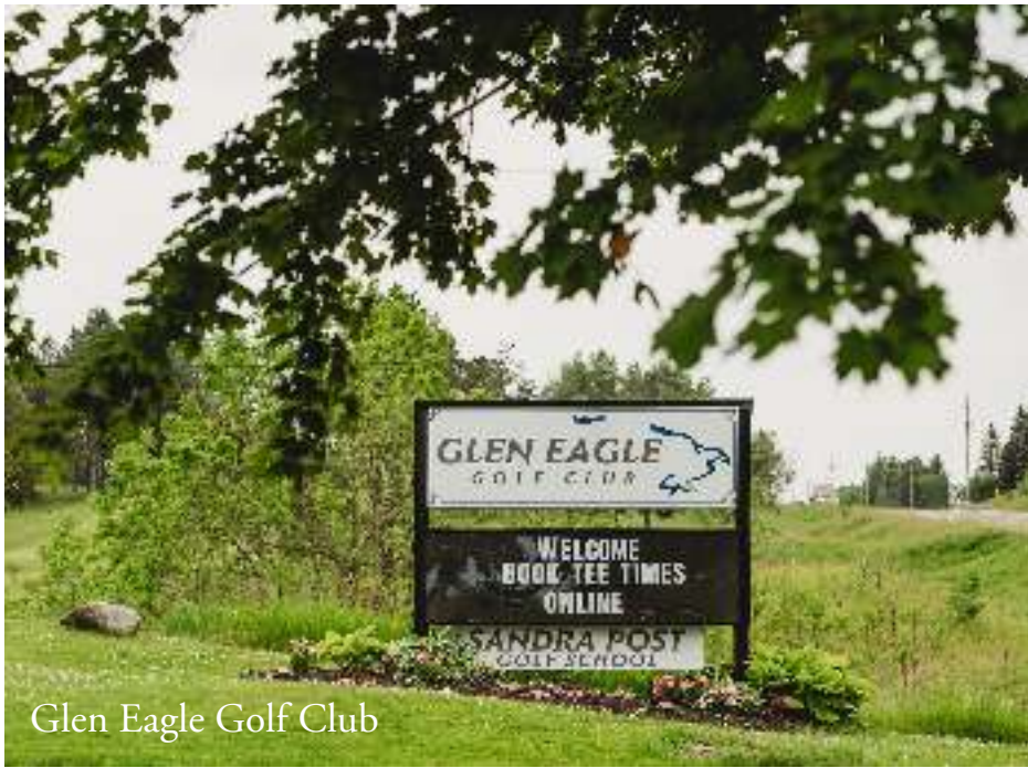
Glen Eagle Golf Club