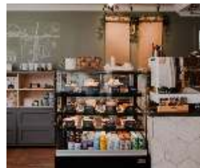
Gather Cafe, Alton