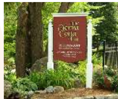
The Terra Cotta Inn