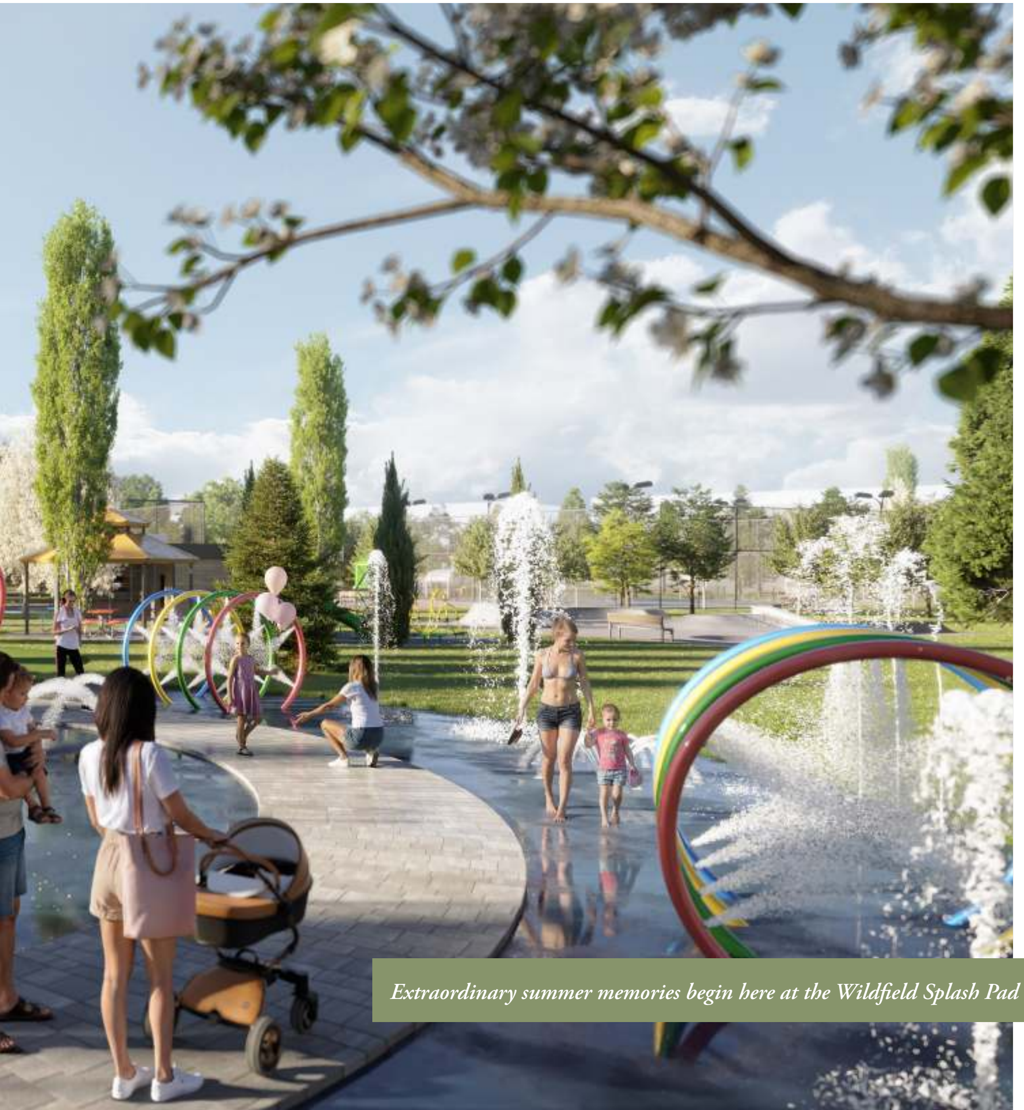
Extraordinary summer memories begin here at the Wildfield Splash Pad