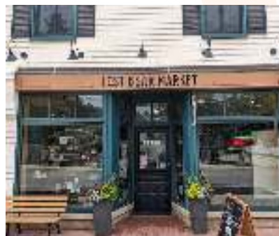
Lost Bear Market