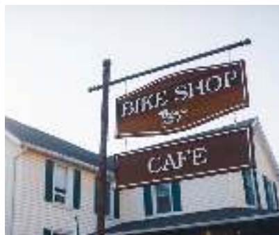
Caledon Hills Cycling Bike Shop and Cafe