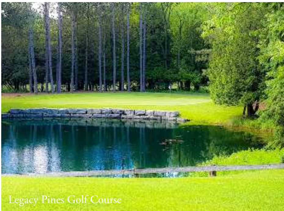
Legacy Pines Golf Course

Fresh air on the scenic fairways of the nearby Mayfield Golf Club and the Glen Eagle Golf Club , is a beautiful way to enjoy the outdoors. Whether it's an early morning tee time, a weekend round with friends or simply the pleasure of living near open green spaces, Caledon's finest golf courses are close to home.