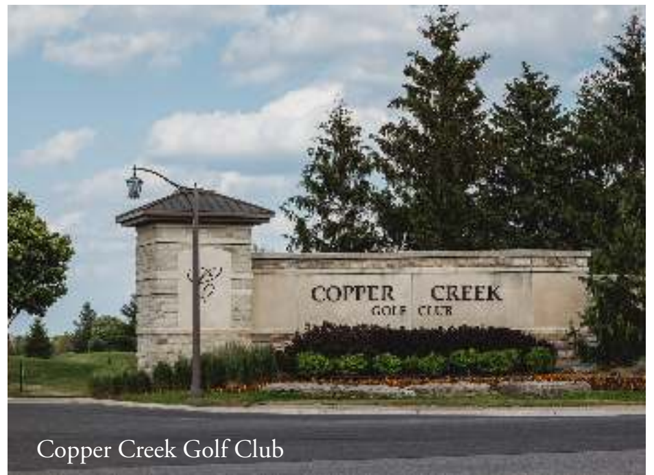
Copper Creek Golf Club